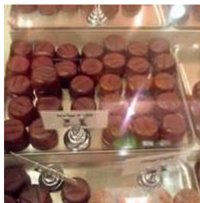
Need a sweet gift for a chocolate lover? How about a Philadelphia Chocolate Tours gift certificate!