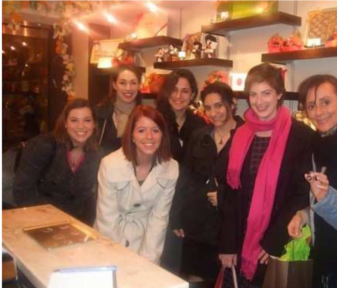
A Philadelphia Chocolate Tour visits Teuscher Chocolates