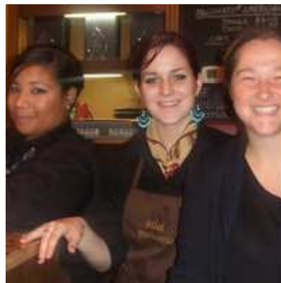
The team at Miel Patisserie